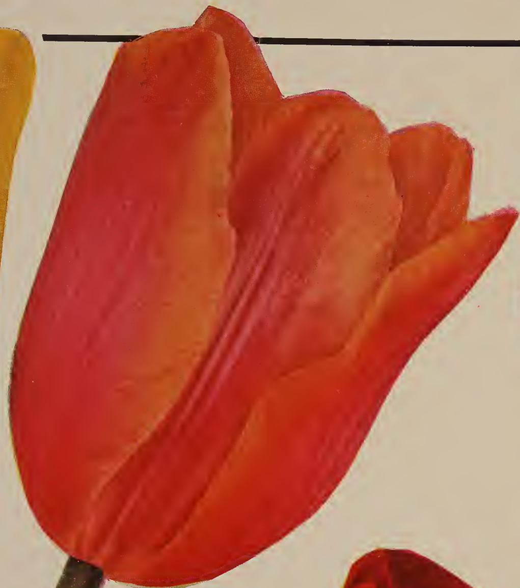
DIDO 60 cts. for 10; $5.00 per 100 See page 15